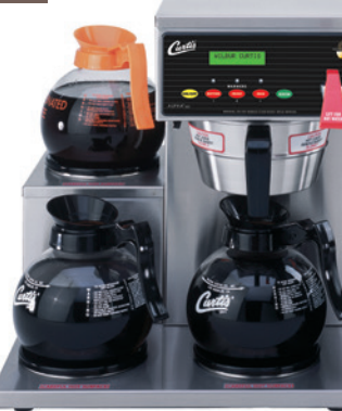
The professional segment is completed by an extensive and diversified premium Hotel Equipment offering.